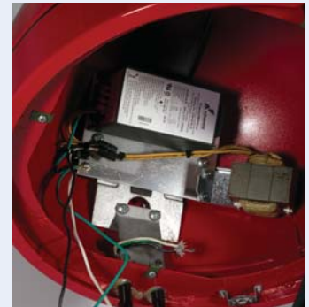
Install new ballast tray.