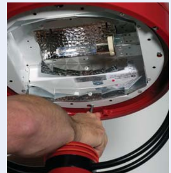
Replace reflector and install lamp.