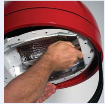
Remove reflector and ballast tray

Retrofitting can take between four and ten minutes per luminaire.